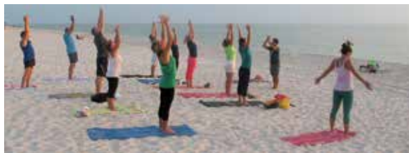
GREEN MONKEY YOGA SUNSET BEACH YOGA