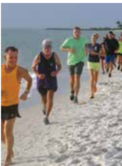
BEACH BUM RUNNERS