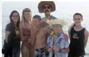
FAMILY PARTICIPATION FOR DLC