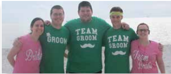
WEDDING PARTY ENJOYS A FRIENDLY COMPETITION